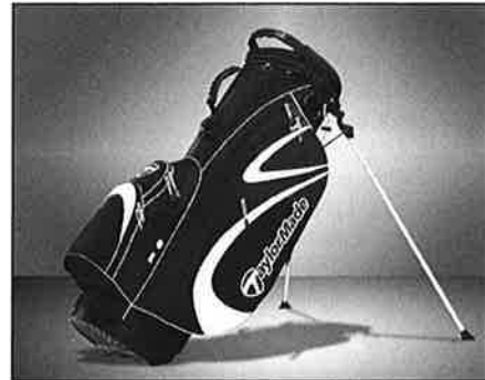
TaylorMade Pure-Lite 2.0 Stand Bag

We recently were gifted—it's true, Father's Day came early for us this year—with a beautiful new set of irons. Trouble is, this makes some of our other golfing utensils look a bit shop worn. What's a duffer to do? That's easy—we treated ourselves to some of the season's best golf gear from TaylorMade, Carlsbad, Calif.