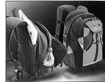
Airbak Focus Tech

The Airbak Focus Tech ($99.99) uses a built-in air cushion to shield delicate cargo and spread the load more evenly across the back. The majori-