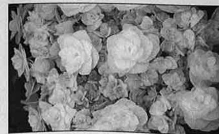
Double Delights Hydrangea Perfection

The Double Delights Wedding Gown Hydrangea is earlier to bloom than other Hydrangeas and will reflower until frost. With stunning white double blooms against dark green to mid-green foliage, it also is suitable for shade gardens, and makes a lovely container plant.