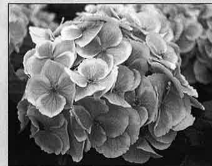
Next Generation Hydrangea Pistachio

against dark green to green foliage. Requiring less pruning, this low-maintenance plant is suitable for shade gardens or containers.