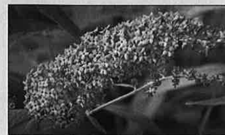
Buddleia Flutterby Petite Blue Heaven

The Double Delights Star Gazer Hydrangea offers a collection of double blooms for more flower power. This lacecap hybrid has large flowers with blue centers and white picotee edges