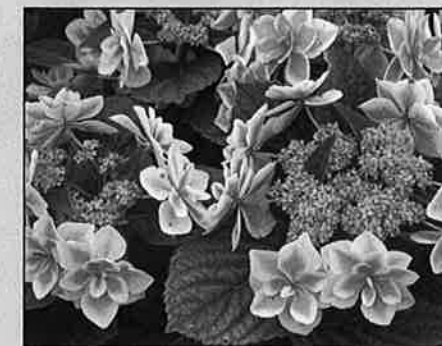
Double Delights Hydrangea Wedding Gown

For more information on the wide variety of plants and vegetables offered by Ball Horticultural, as well as planting tips and other supports, visit www.ballhort.com .