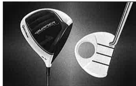
TaylorMade Burner SuperFast 2.0 Driver and Corza Ghost Putter

For starters, we went with the Pure-Lite 2.0 Stand Bag, the company's lightest full size, that helps you "walk lighter, walk longer, and perform at your best." The fit and support delivered by Pure-Lite is a revelation—and isn't it amazing how a bag can affect your score? The Pure-Lite has a