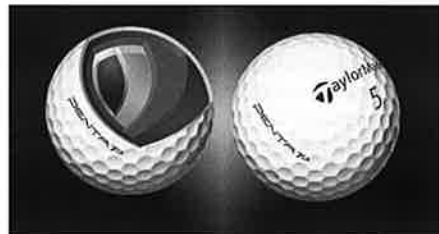
TaylorMade Penta TP Tour Ball

The Burner SuperFast 2.0, with its more aerodynamic clubhead, is longer, lighter, and faster. As