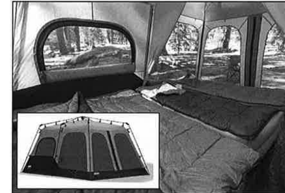
Coleman Instant Tent 8

There is no escaping, obviously, so we instead need to be rescued from the elements—and our hero just appeared on the horizon, the Coleman